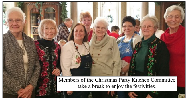
Members of the Christmas Party Kitchen Committee take a break to enjoy the festivities.

We can’t wait ‘til Christmas rolls around again for another great holiday party!