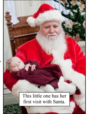
This little one has her first visit with Santa.

A HUGE THANK YOU to all who contributed their time and talents to Santa House 2016!